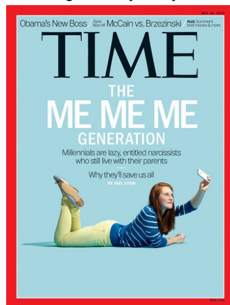
Copertina del Time, 2013

Alcuni opinionisti 5 hanno salutato questa iniziativa come la più concreta dimostrazione di quanto i Millennials non siano poi solo egocentrici e narcisisti, ma sappiano impegnarsi per le cose in cui credono e spendersi per valori importanti, la cui realizzazione non intendono affatto lasciare ad altri – mentre loro "fanno i propri comodi" –, anzi impegnandosi a fondo perché il futuro, che saranno i primi ad abitare, sia migliore di questo presente.