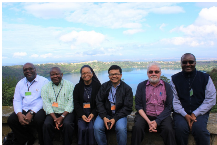
Ariccia, Sedos Residential Seminar, 2018