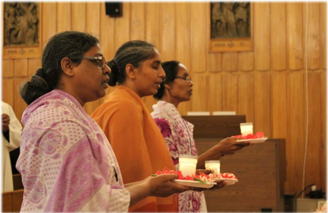
Ariccia, Sedos Residential Seminar 2018