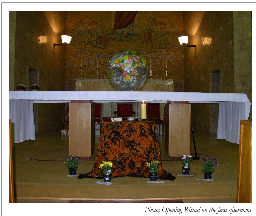
Photo: Opening Ritual on the first afternoon