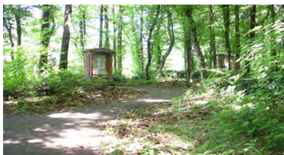
Photo: a view nearby 'Casa Divin Maestro'