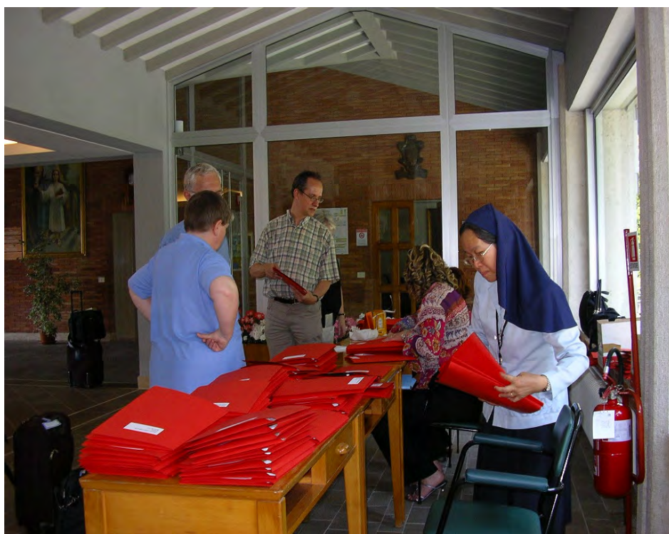
Photo: Arrival and Registration