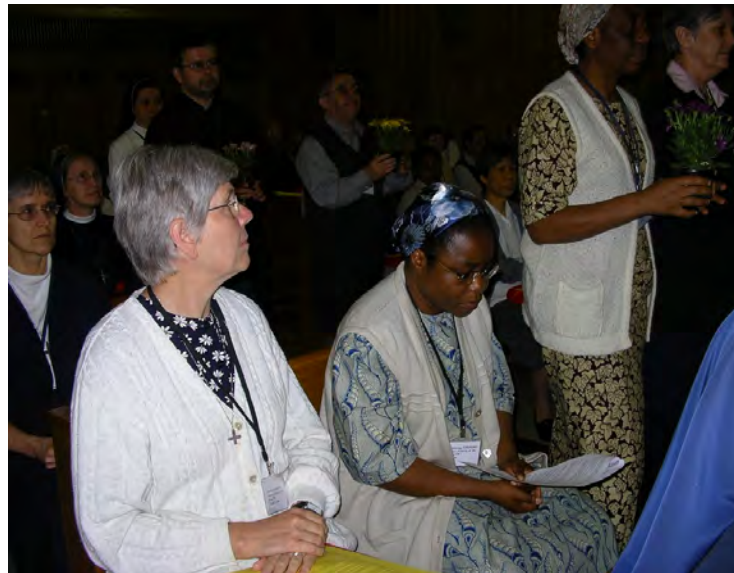
Photo: During the daily celebration

List the continents where the Institutes are working